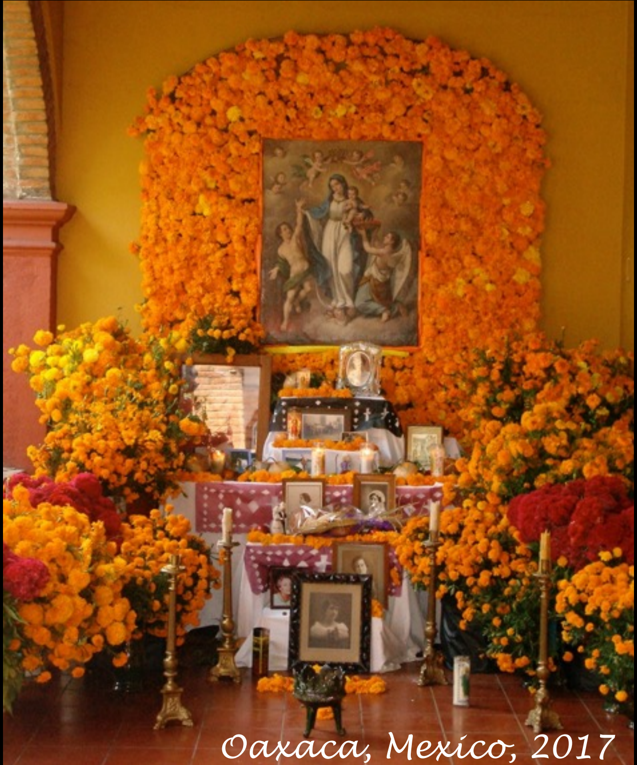
Oaxaca, Mexico, 2017